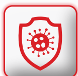
UVC & Ionizer