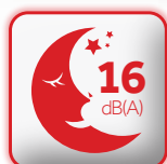
Ultra Silence Mode 16dB(A)