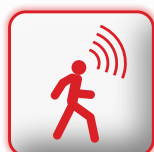
ECOPILOT Motion Sensor (follow/avoid)